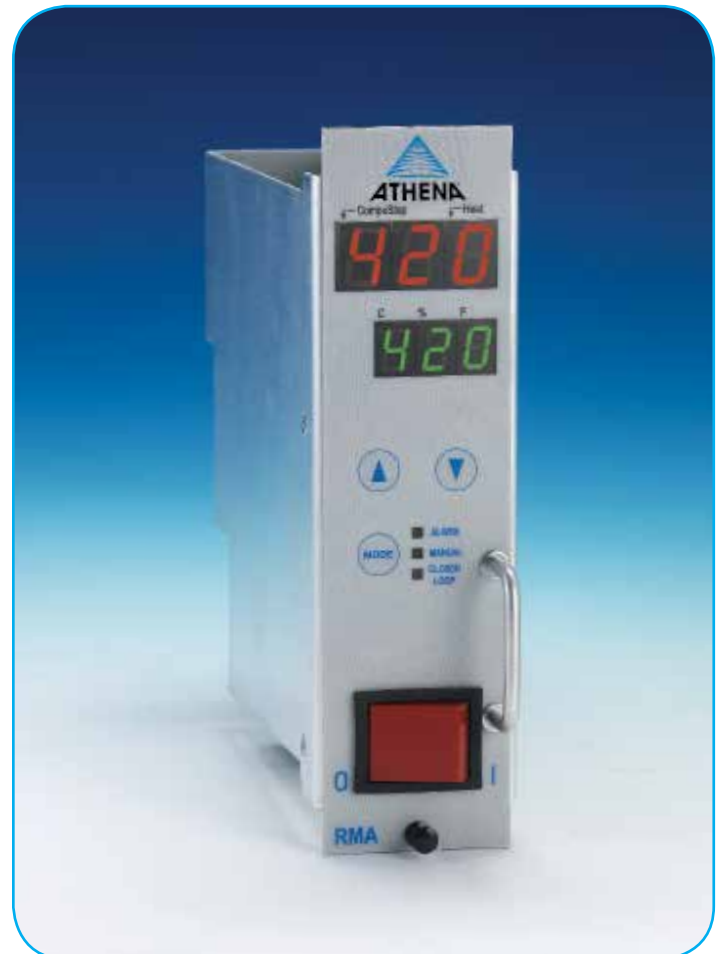
Fig 1. RMA Modular Controller showing single zone temperature control.